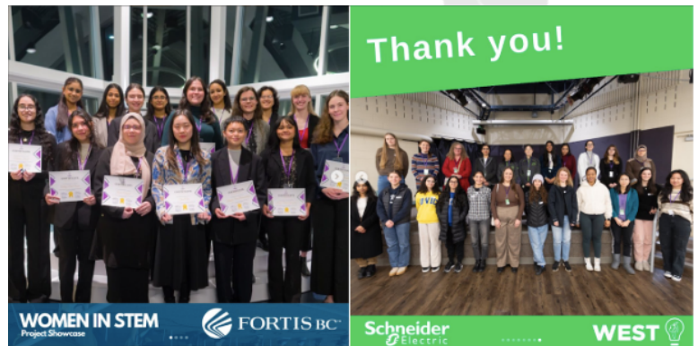
Pictures from last year and this year's project on @uvicwest on Instagram

success and an enriching experience for the participants. The participants don't only work with each other, but also with professionals in the focused field. They receive professional feedback at every stage of the project. You will get to do networking with both university students and professionals.