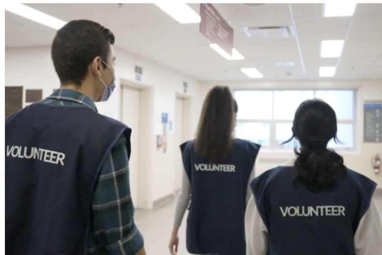
Step Up Youth Program Website

The process to get into the program is an online application followed by an interview. More information and the online application is available on this website: https://www.islandhealth.ca/volunteer-resources/volunteer-opportunities/step-youth-program . The closing date for applications for the next session is May 31, 2024.