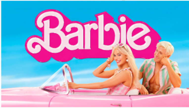
Credits to the Official Barbie Movie Poster